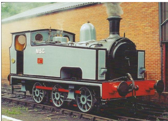
Manchester Ship Canal No 67 Hudswell Clarke 1329 of 1921 simmers outside the engine shed at the Middleton Railway

Built 1955 by Hudswell Clarke and Co. Ltd, Leeds for the Mirvale Chemical Company. Preserved on the Middleton Railway, Moor Road, Leeds LS10 2JQ