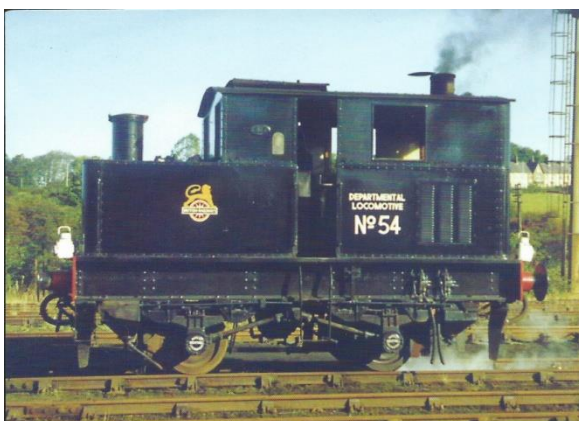
British Railways Departmental Loco 54 Sentinel 8837 built 1933 Stands in the yard at Padiham Power Station during an open day

© 2004 Middleton Railway Trust Ltd The Station Moor Road Leeds LS10 2JQ