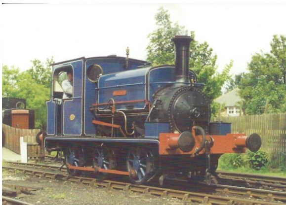
Matthew Murray Manning Wardle 1601 built 1903 reverses onto its train at the Middleton Railway

© 2004 Middleton Railway Trust Ltd The Station Moor Road Leeds LS10 2JQ